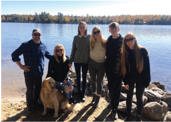
Family time at the cottage.